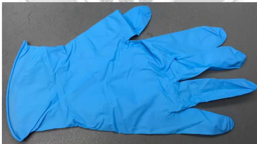
Photo : Disposable Nitrile Glove, Size M